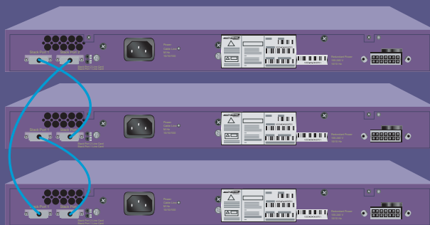
Figure 1: Summit 400-24p UniStack Stack Cabling Illustration