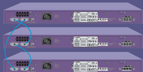
Figure 1: Summit 400-24t UniStack Cabling Illustration